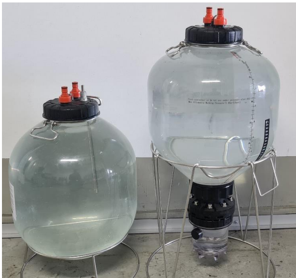
Left: 30L all-rounder and 27L conical at 0 PSI Unpressurised – Pre hydro test

Note: It is normal for the FermZilla tank to swell in size and stretch during the hydro test.