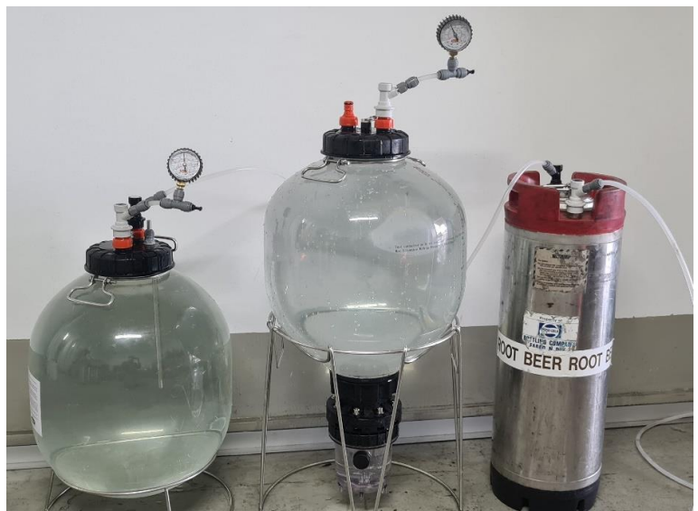
Right: 30L all-rounder and 27L conical pressurised with water at 4.0 Bar

Irrespective of which method is used the pressure should be increased slowly and in a controlled manner.